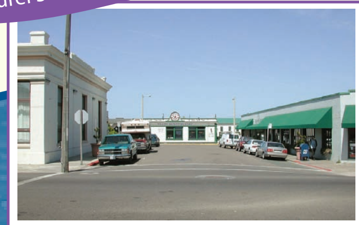
Laurel Street, Looking West ...

An important objective expressed by the Fort Bragg community is to improve the image and identity of Downtown while being true to local heritage and sense of place. The Streetscape Furniture Palette was developed by surveying the preferences of the community and incorporating local history and materials. It provides guidance for streetscape improvements within Downtown Fort Bragg's rights-of-way, as well as improvements made to properties and buildings by the private sector. Streetscape Furniture Palette specifications are included in the Downtown Fort Bragg Implementation Program .