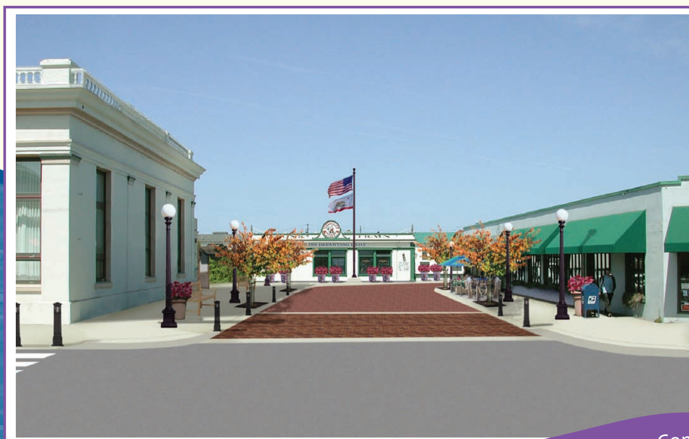
...Transformed as "Depot Commons"