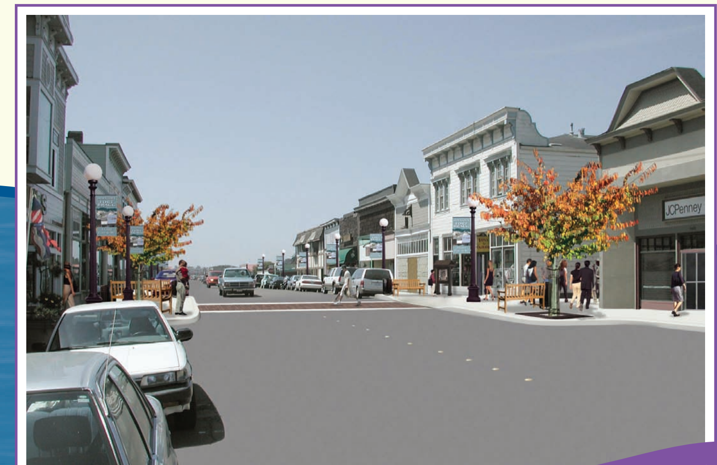
... With Improved Streetscape