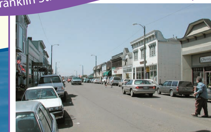
Franklin Street, Looking South ...