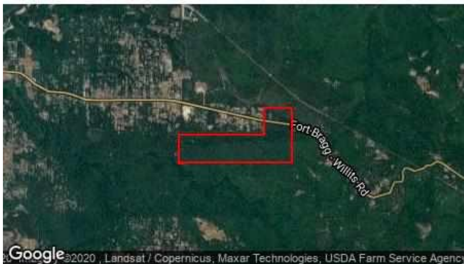
Photo 2: Parcel map for CCTS property. The CCTS is located on the portion north of Highway 20.

The location involves land owned by the California Department of Forestry (“Forestry”) as part of the Jackson Demonstration State Forest. Development of the CCTS at the Highway 20 site involved a three way land swap involving the City/County and two state agencies, Forestry and the California Department of Parks and Recreation (“State Parks”). The City/County would take ownership of a 17 acre portion of the Jackson Demonstration State Forest (“JDSF”). State Parks would then transfer 12.6 acres from the Russian Gulch State Park (“RGSP”) to Forestry to compensate for the 17 acre portion JDSF transferred to the City/County. State Parks would then receive a 60 acre conservation easement from the City/County over the Caspar disposal site and adjacent area from the City/County. Legislation was required to authorize the land exchange. In 2011, Wes Chesbro sponsored legislation for AB 384.