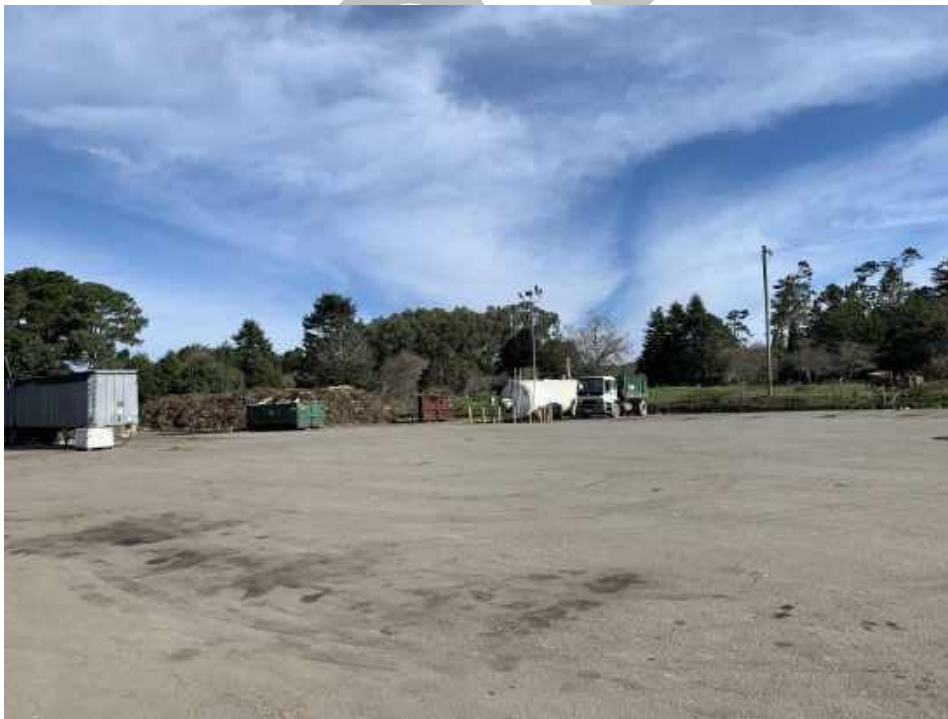
Photo 11: Part of the Loadout and Organics Area, Looking to Northeast Corner