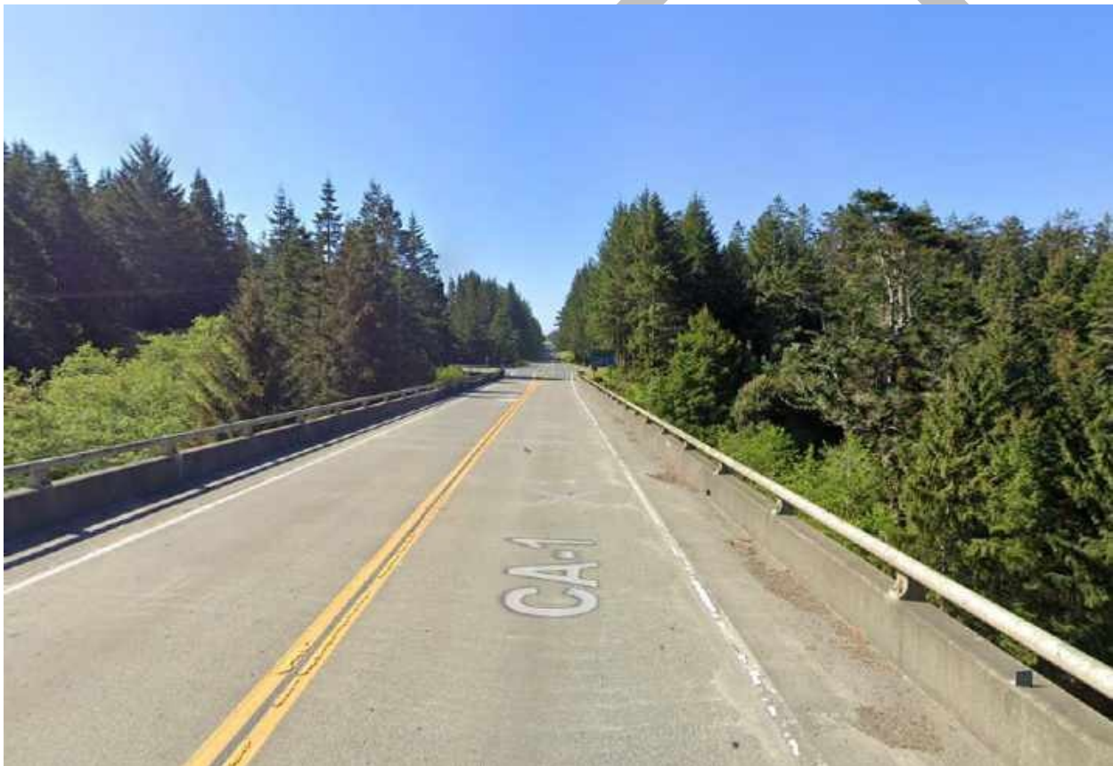
Photo 14: Caspar Creek Bridge as part of Highway 1, looking at the intersection with County Road 409

It was brought to Diversion Strategies' attention throughout the course of the research phase of the project that the Caspar facility is not in an ideal location for an industrial facility that would be serviced by tractor-trailers. This is mainly due to the inability to construct a turn pocket appropriate and necessary for tractor-trailers to turn onto County Road 409 from Highway 1 and vice versa.