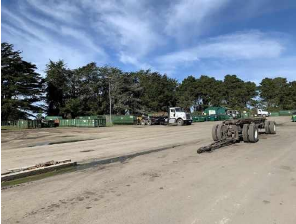
Photo 10: Bin and Truck Storage, looking to Northwest Corner of Facility