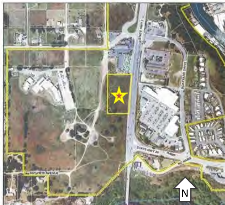
Figure 1: Project Site

LOCATION: The proposed 3.16 acre project site is located at 1250 Del Mar Drive on Todd Point within the City of Fort Bragg city limits just north and west of the Highway 20/Highway 1 intersection. The parcel is located within the coastal zone. APN 018-450-40 & 018-450-41. The site is bounded to the north by a hotel and mini-golf course, to the east by Highway 1 and to the south and west by undeveloped property. The Project is approximately three quarters of a mile west of the existing Highway 20 water tank.